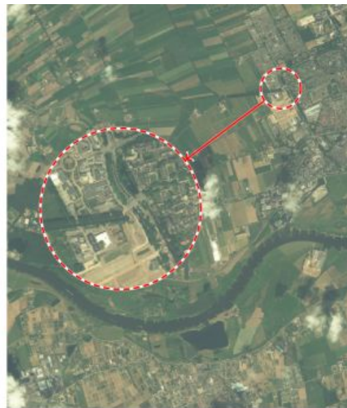
(b) WV-2 color image