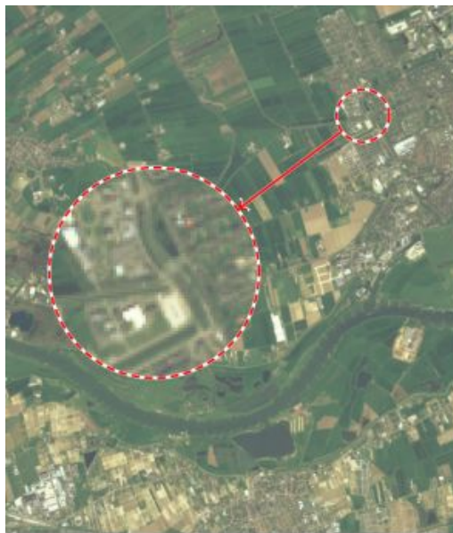
(a) S-2 color image