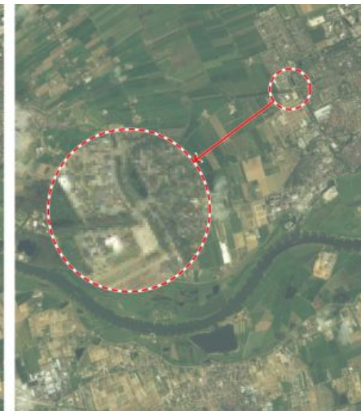
(d) Multiple S-2 images